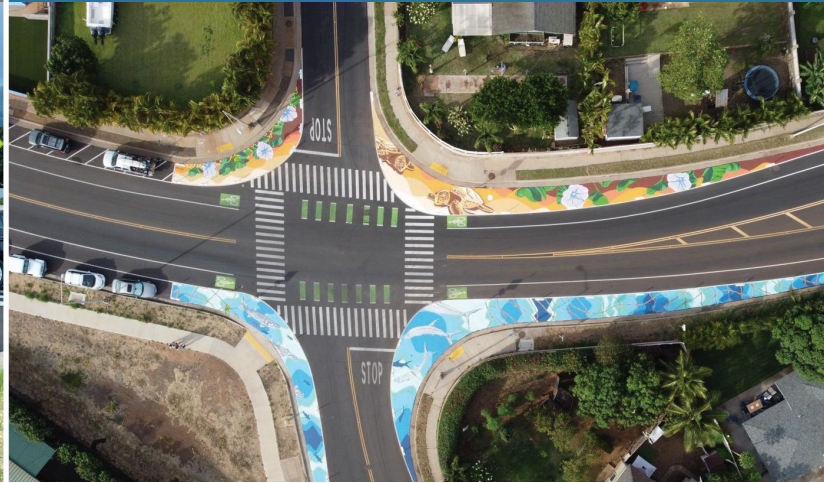
▲ Street Art Project (May 14, 2025)