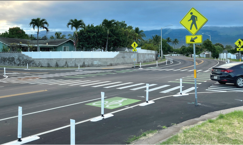
▲ Curb extensions and bike conflict marking quick build treatments at Kenolio Road and Alulike Street (February 13, 2024)